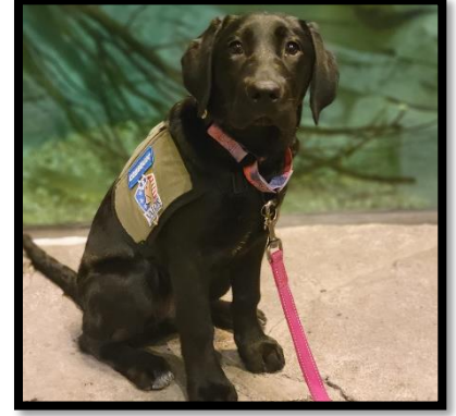
Walker – Donated by Warrior Canine Connection