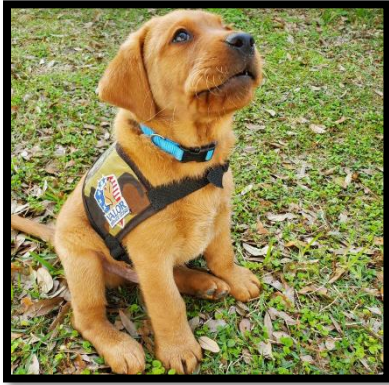
RJ – Sponsored by Scoop Soldiers, donated by Project 2 Heal