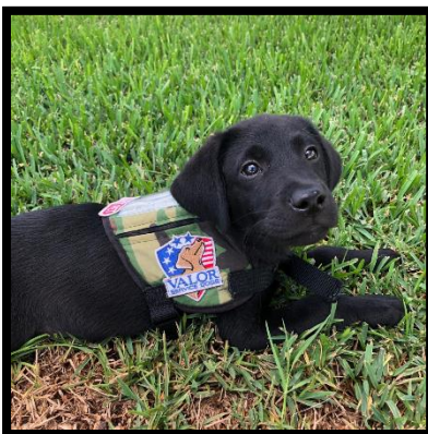
Tubby – Sponsored by the Campbell Family Foundation