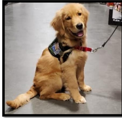
Cadence – Sponsored by the Campbell Family Foundation