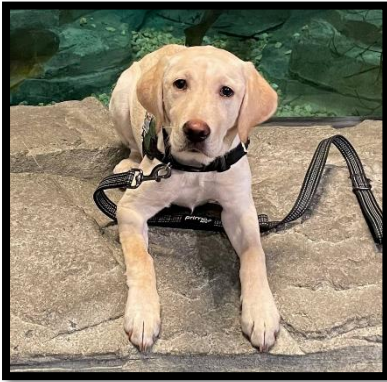
Molly – Sponsored by the Campbell Family Foundation, donated by Warrior Canine Connection