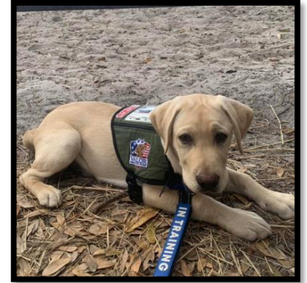
Bogey – Sponsored by Darling Ingredients, donated by Warrior Canine Connection