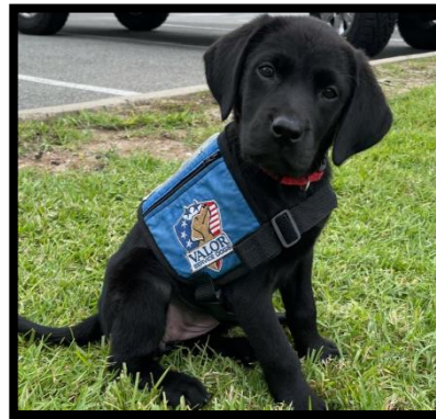
Ghillie – Sponsored by Lone Goose Lodge